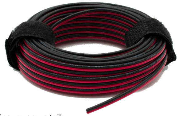
Figure 8 Wire