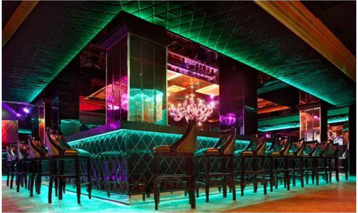
RGB LED STRIP LIGHT (High Brightness) 14w/m